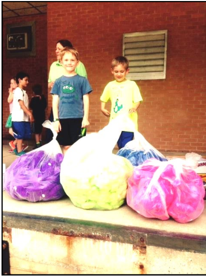
Hillsdale Elementary School students gathered stuffed bears and school supplies for the children in our program.

At DVCCC we are deeply grateful that the community of Chester County continues to embrace our mission through fundraising, awareness events and volunteering. A few examples are highlighted on this page.