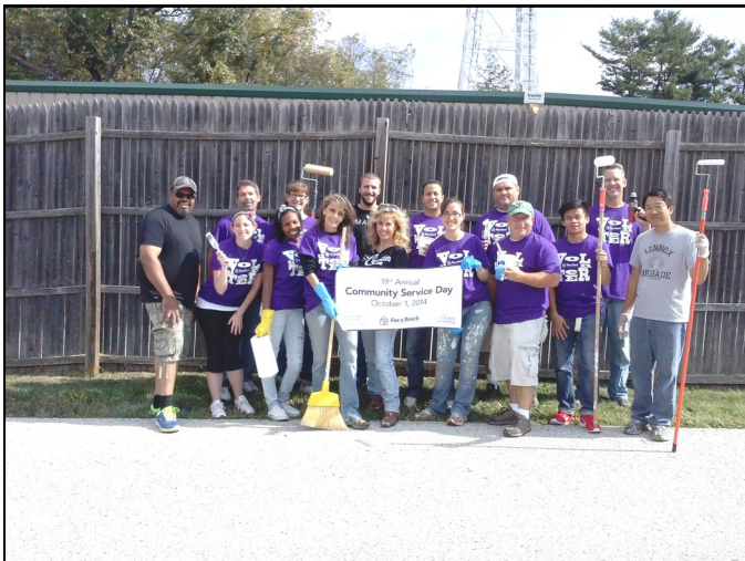
Employees of Berkshire Hathaway Home Services Fox & Roach helped to prepare a new home for a survivor and her children at our Garfield Commons townhomes.