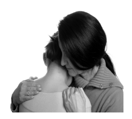
"...it felt like the person on the other end of the phone was hugging me so tight that it didn't leave any room for fear..."

"Being a program participant not only saved my life but changed my motivation. Not only do I have peace of mind but I have an extended family that I can call on in time of need or just to say hi. Prior to utilizing the services offered by Domestic Violence of Chester County, I felt lost and hopeless with not much family support. Not too many people believed my story or were too afraid to help fearing something would happen to them. When I reached out to Domestic Violence of Chester County I felt like the person on the other end of the phone was hugging me so tight that it didn't leave any room for fear, and to this day I feel the same way no matter who I talk to. I had been living in a bubble unable to think independently because of all that my children and I witnessed and lost. I needed guidance...anxiety, stress, denial, children sleeping in my room, curtains closed, lights out – as if no one was home, the loud pounding of my heart beating rapidly at my chest, jumping at every thump the children made...mentally trapped. That one phone call made all the difference." Victim/Survivor from Oxford, PA.