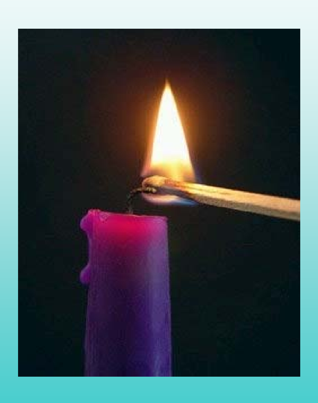
Remembrance and Recognition